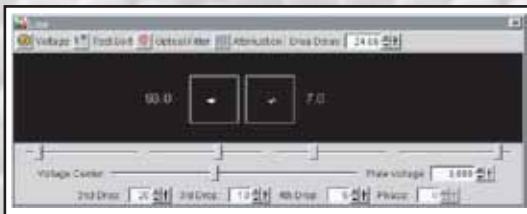
Initial Drop Delay Profile with Spherotech Drop Delay Calibration Particles